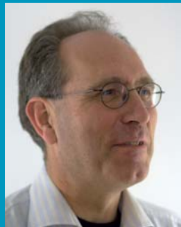
Hans Hofman | The National Archives of the Netherlands

“Preservation Planning tools will dramatically enhance the ability of institutions to plan for the preservation of their digital assets without the expense of lengthy analysis from specialist digital preservation staff.”