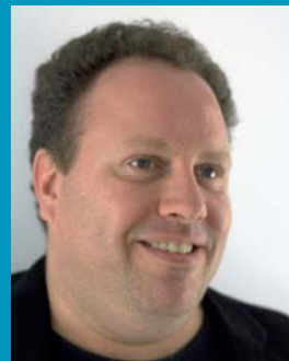
Frank Houtmann | The National Library of the Netherlands

“Preservation Action tools form a core component of the Planets digital preservation solution. Planets will wrap existing tools, and plug gaps in current provision to ensure yesterday's and today's digital resources can still be used.”